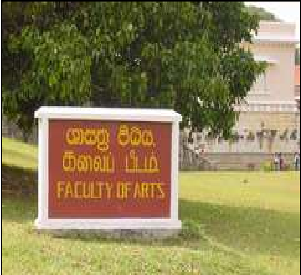
At the Entrance to the Faculty of Arts