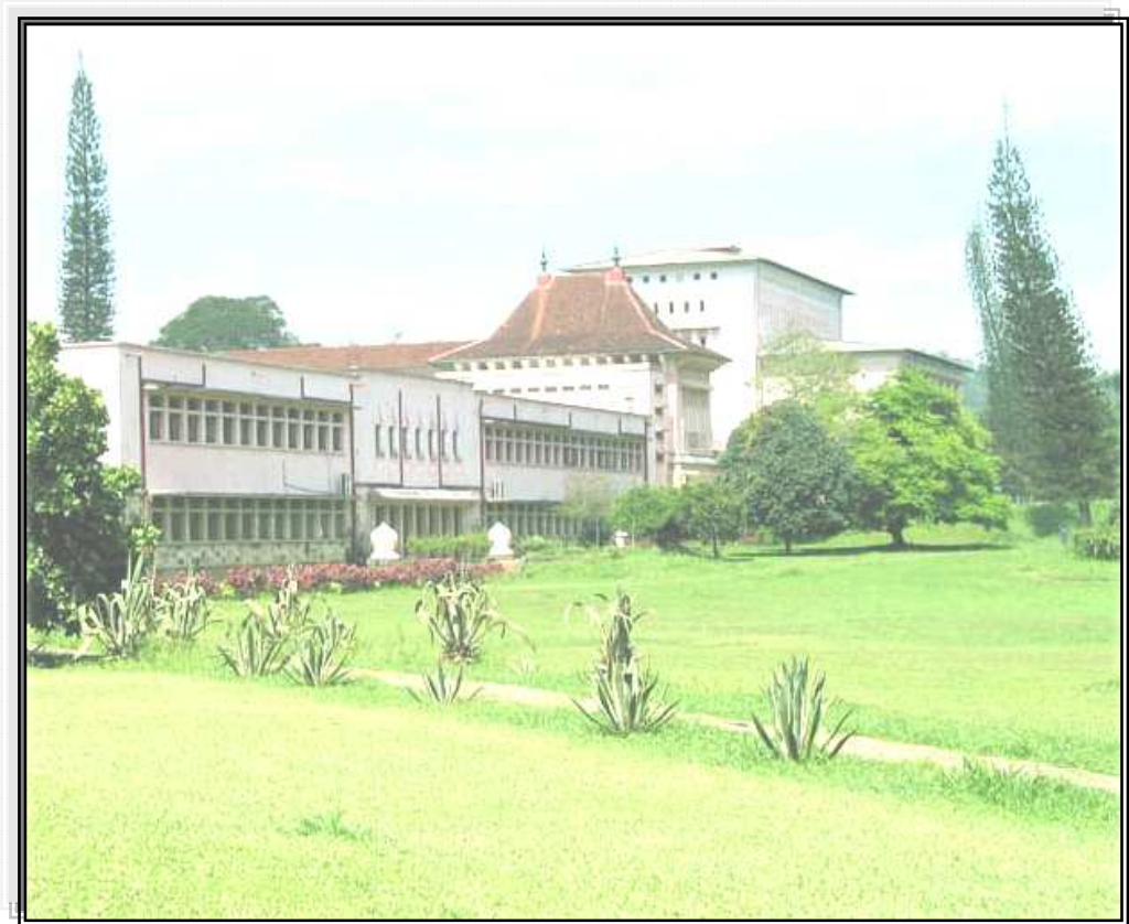
Main Arts Building