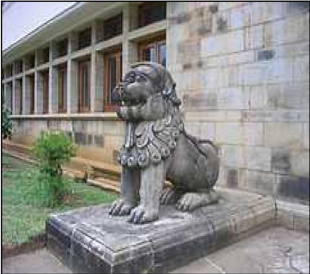
Lion Statue at the Entrance of the Main Arts Building